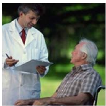
Long-term care is not just provided in nursing homes--in fact, the most common type of long-term care is home-based care.